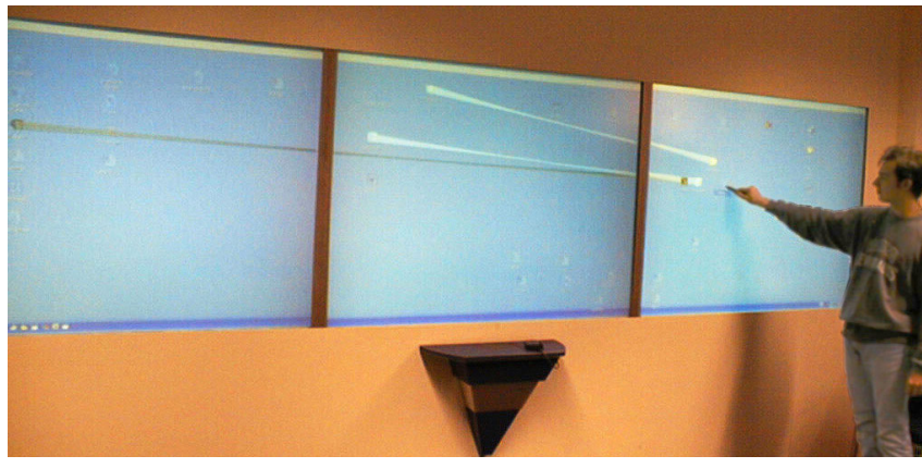
Figure 2: This user drags an icon into a distant folder using drag-and-pop. As he starts dragging the icon towards the left, all potential targets located in that direction "stretch" towards him.

Our follow-up project Mouse Ether [4] simplifies targeting with the mouse across multiple monitors by compensating for the distortion of the mouse path otherwise caused by bezels, gaps, and resolution differences. We found mouse ether to improve participants' targeting performance by up to 28%.